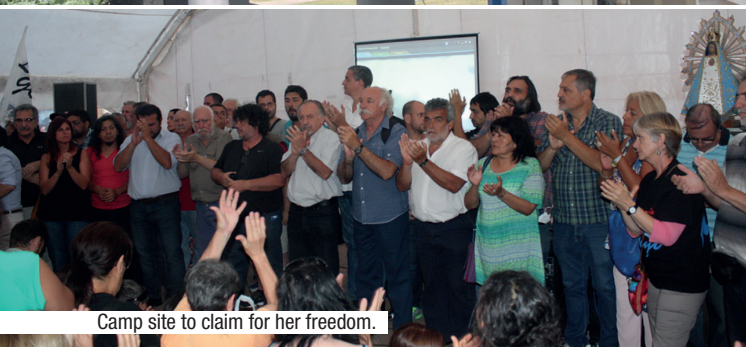
Camp site to claim for her freedom.