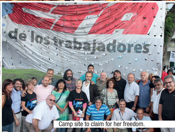
Camp site to claim for her freedom.