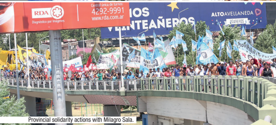
Provincial solidarity actions with Milagro Sala.