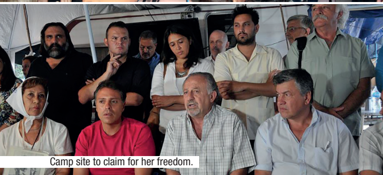
Camp site to claim for her freedom.