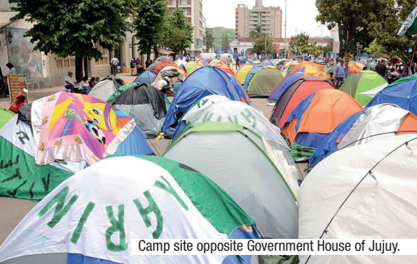
Camp site opposite Government House of Jujuy.