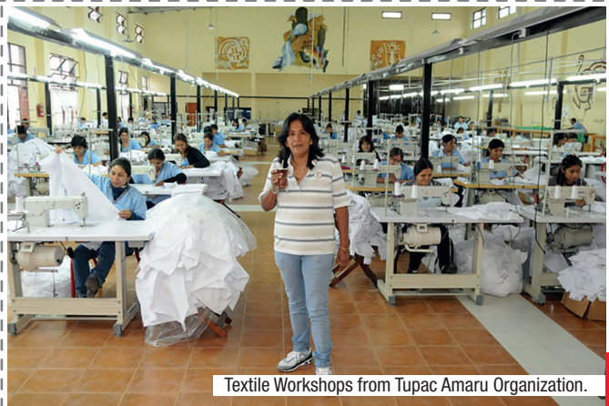
Textile Workshops from Tupac Amaru Organization.

FREEDOM TO MILAGRO SALA • NO MORE POLITICAL PRISONERS