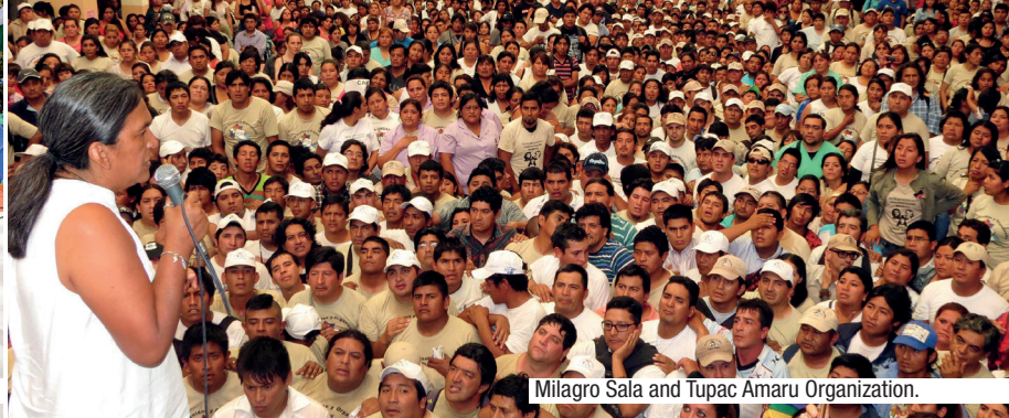
Milagro Sala and Tupac Amaru Organization.