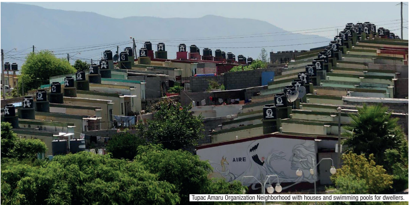
Tupac Amaru Organization Neighborhood with houses and swimming pools for dwellers.

Milagro Sala is detained because she proved that if money for public works is allocated to Work Cooperative Associations, they create more housing, more community neighborhood works and more jobs; while if allocated to private companies, profits are only to enrich a few. ■